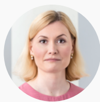
RIINA SIKKUT, MINISTER OF HEALTH AND LABOUR, ESTONIA