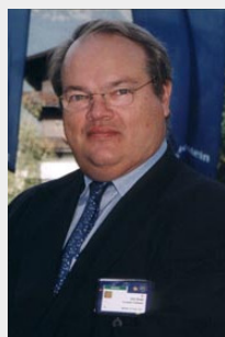
John Bowis , former MEP, former Minister of Health of Great Britain