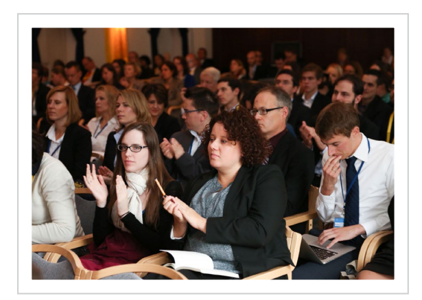
Participants of the EHFG 2013.

The plenary continued with keynote speeches by Tonio Borg, the EU Commissioner for Health, Alois Stöger, the Austrian Minister of Health, and Daniel Bahr, the German Minister of Health. The overarching themes of their interventions were that health was a value in itself while at the same time it payed off to invest in health, for example in economic terms.